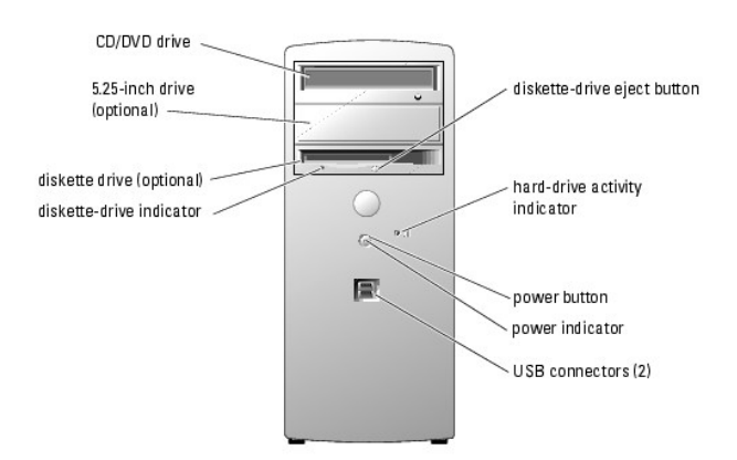
Table 1-1. Front-Panel Buttons and Indicators